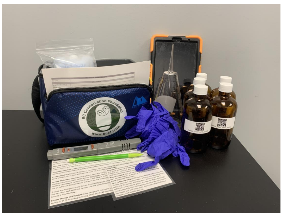
Figure 1. 6PPDQ sample collection kit

Ensure that provided ice packs are frozen before heading to the sample location(s).