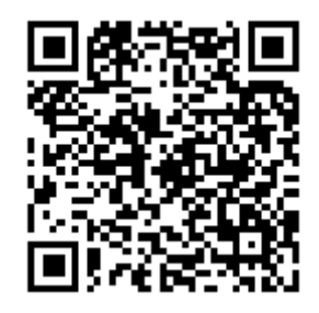
Figure 3. QR code to access the data collection form on AppSheet.

Once downloaded, you will need to make an account as this will allow for better offline performance. Once an account has been created, you can click this <u>link</u> or use the camera on your phone/tablet to scan the QR code below (Figure 3) and open the data collection form. When it opens in the browser, it should then redirect you to AppSheet. Once in AppSheet, select "Install", underneath the AERL logo. These steps should only be required once, and the form required for sample collection should stay within AppSheet for all future use.