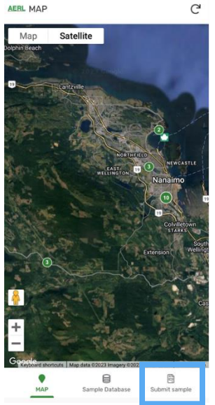
Figure 4. Image depicts location of 'Submit sample' option in the data collection app. Once on the appropriate screen, fill in the information requested by the data collection app. Each heading below will discuss the data field in more detail and what is required of the data collector. One submission will be required for each sample collected.

In order to collect data for your sample, select the 'Submit sample' page, located in the bottom right corner of the screen (Figure 4).